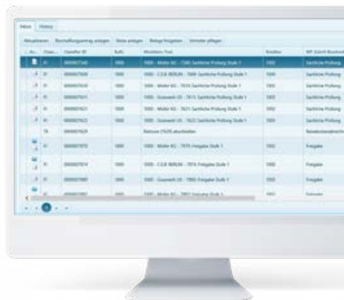
Incoming invoice ledger via the web interface