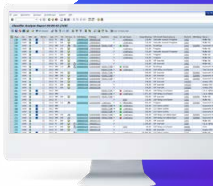
Incoming invoice ledger in SAP ERP and S/4Hana

The data captured directly from the invoice is automatically registered and processed in the SAP system. In the context of invoice approval, even non-SAP users are integrated in the approval process via a web interface. They are instantly informed via email that they have invoices to review or approve..